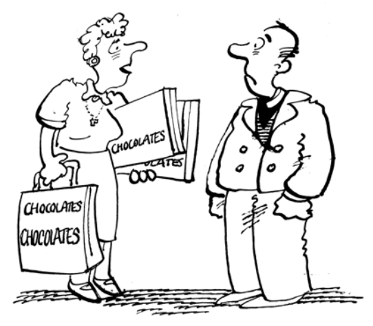
I am stockpiling, just in case...

The Methodist Relief And Development Fund (ALL WE CAN), The Methodist Action for Children, Methodist Homes (MHA), Methodists for World Mission and Ealing Street Pastors are amongst those listed.